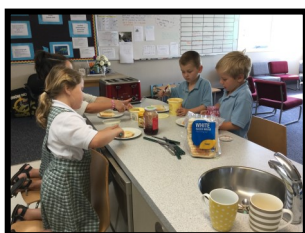
ROOM 3 MAKING TOAST! YUMMY!