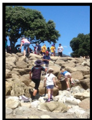
YEAR 3/4 CAMP