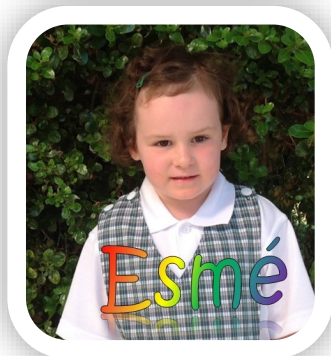
NEW TO SCHOOL!