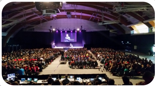
NATIONAL YOUNG LEADERS DAY 2016... OUR SCHOOL LEADERS