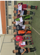
Prize Winner 2016

Drilling techniques – Open, Closed, Indian and even advanced hitting – this will include off both feet Pressing – including, pushing, sweeps (forehand and reverse) Elimination Skills – including V Drag and 3D Aerial skills Stickhandling Faceoff/Fitness Game related games to teach special awareness